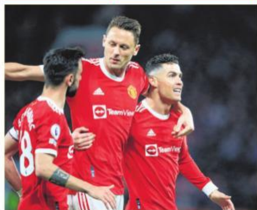
Manchester United's Cristiano Ronaldo (right) celebrates with Nemanja Matic (centre) and Bruno Fernandes after scoring the equaliser during their EPL match on Thursday