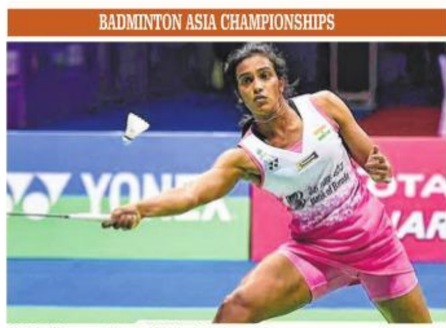
PV Sindhu won 21-9, 13-21, 21-19

The fourth-seeded Sindhu, who had claimed a bronze in the 2014 Gimcheon edition,